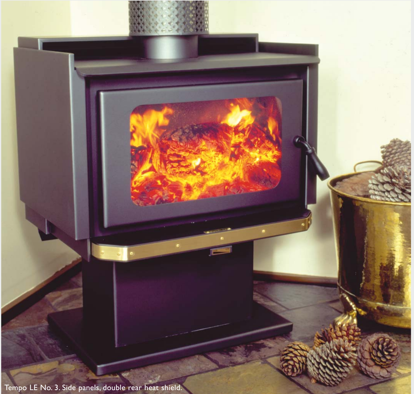
Tempo LE No. 3. Side panels, double rear heat shield.