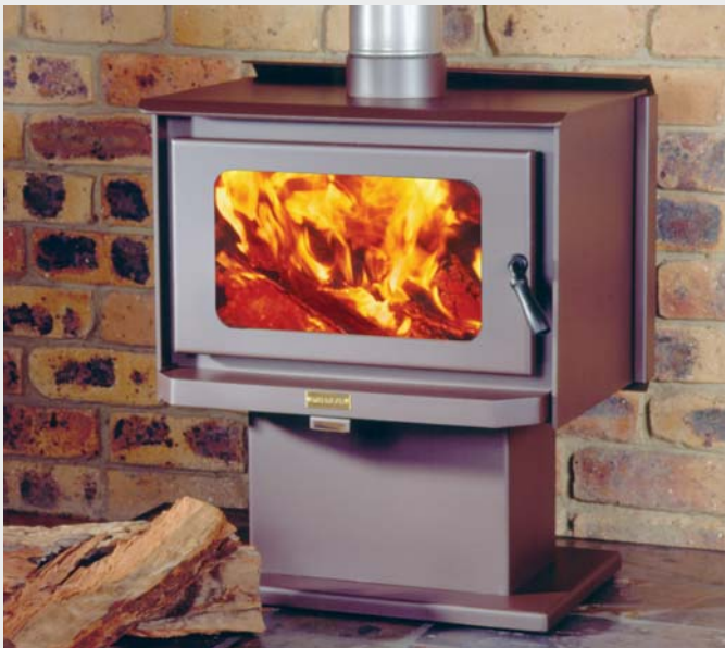
Tempo LE No 1. Pot Belly Replacement (PBR). Rear heat shield.

LONG LASTING • Kemlan is an all Australian company noted for the production of quality products backed by an unsurpassed record of after sales services since 1969. From the outset, the founders built their fireplaces to work and last. The Tempo LE is the result of continuous research and development and maintains the Kemlan tradition • 10 year limited warranty