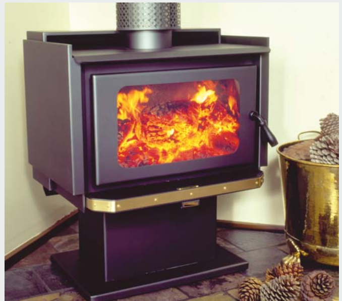
Tempo LE No 3. Side panels, double rear heat shield.